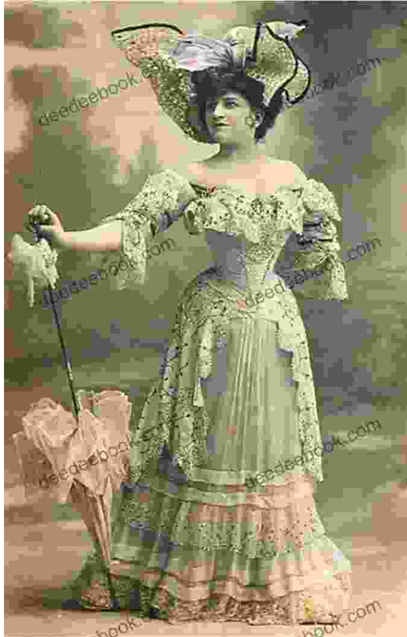
A Victorian lady in a fashionable dress