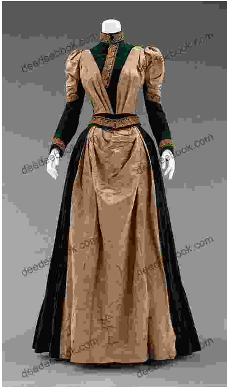
A woman wearing a dress in the Aesthetic Movement style

forms. Women's dresses became more loose-fitting and flowing, and men's suits became less formal.