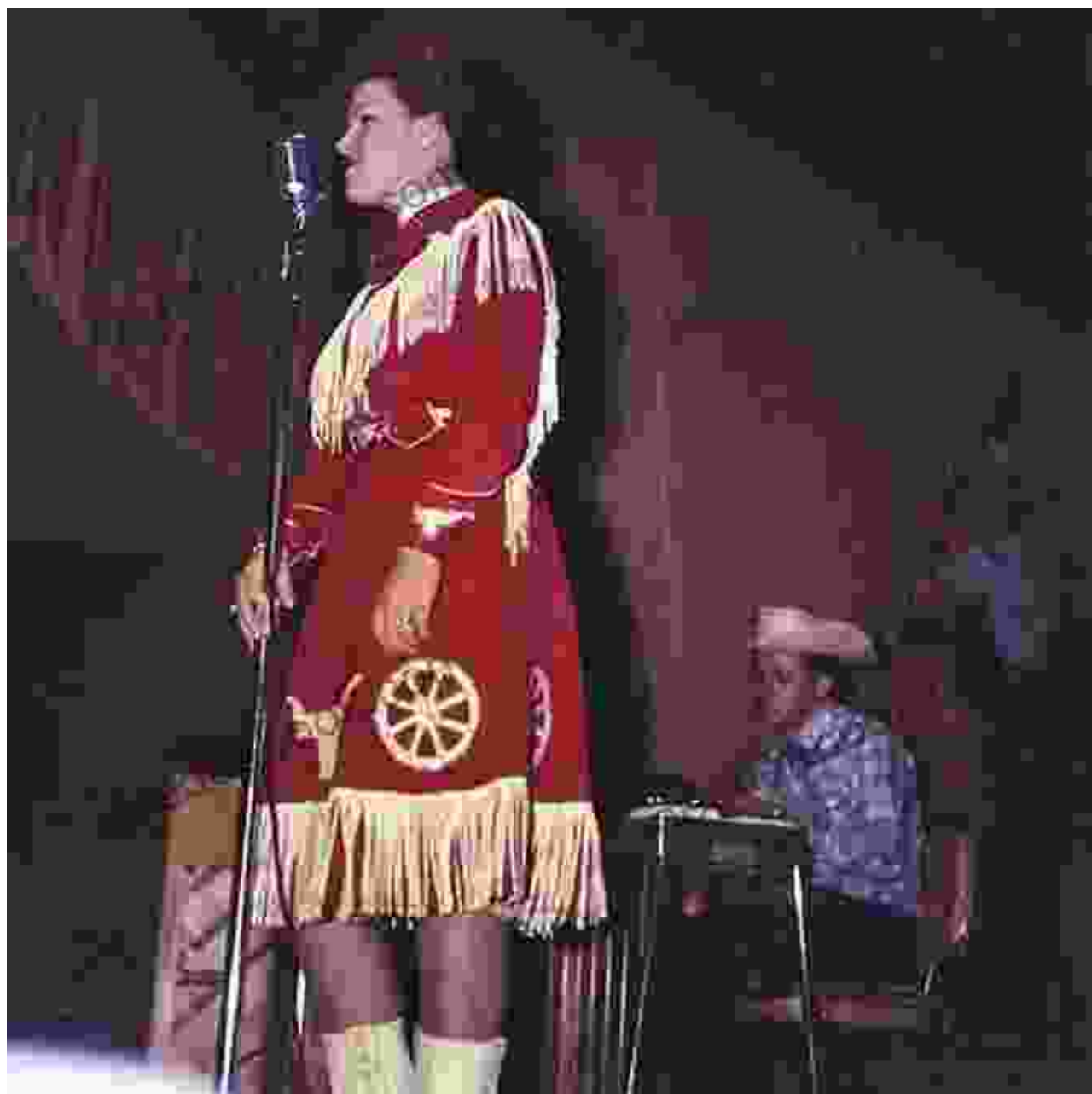
Patsy Cline performing on stage

Patsy Cline was a rising star in country music, known for her powerful vocals and emotive interpretations of heartbreak and longing. Her untimely death in a plane crash in 1963 at the age of 30 cut short her promising career, but her music continues to inspire and move listeners to this day.