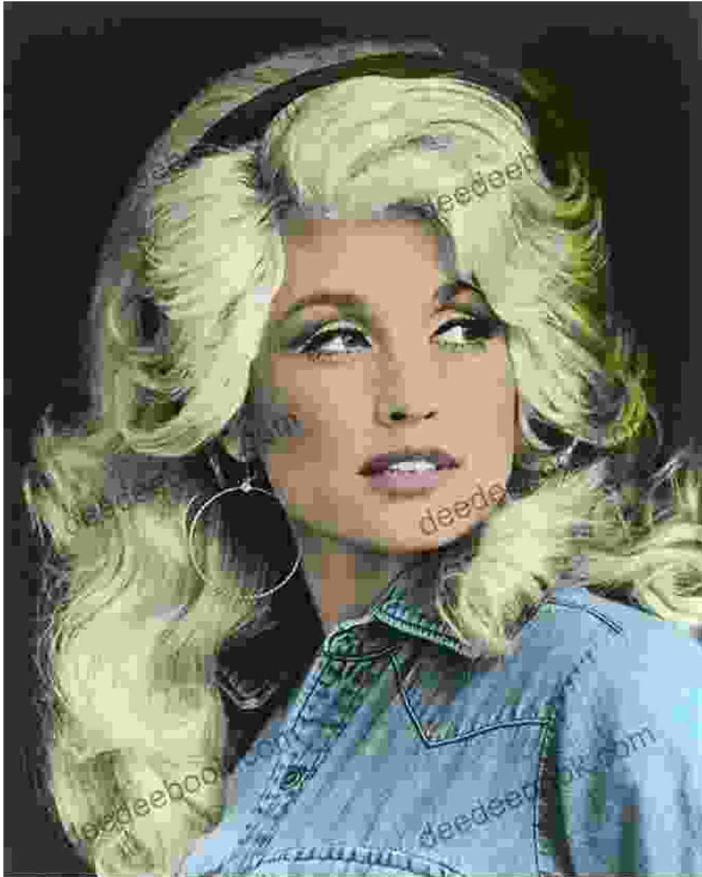
Dolly Parton in her early career

Dolly Parton is one of the most celebrated and beloved figures in country music, but her rise to stardom was not without its challenges. Born into poverty in a one-room cabin in Tennessee, Parton began singing and writing songs at a young age. She faced criticism and rejection from the