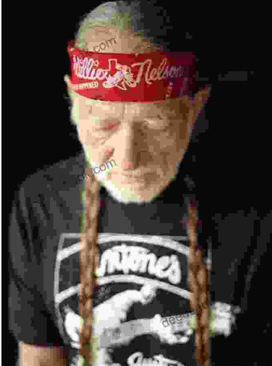
Willie Nelson with his signature braids and bandana

Willie Nelson is a true American icon, known for his unique blend of country, folk, and blues music. His laid-back style, signature braids, and outlaw persona have made him one of the most influential figures in popular culture.