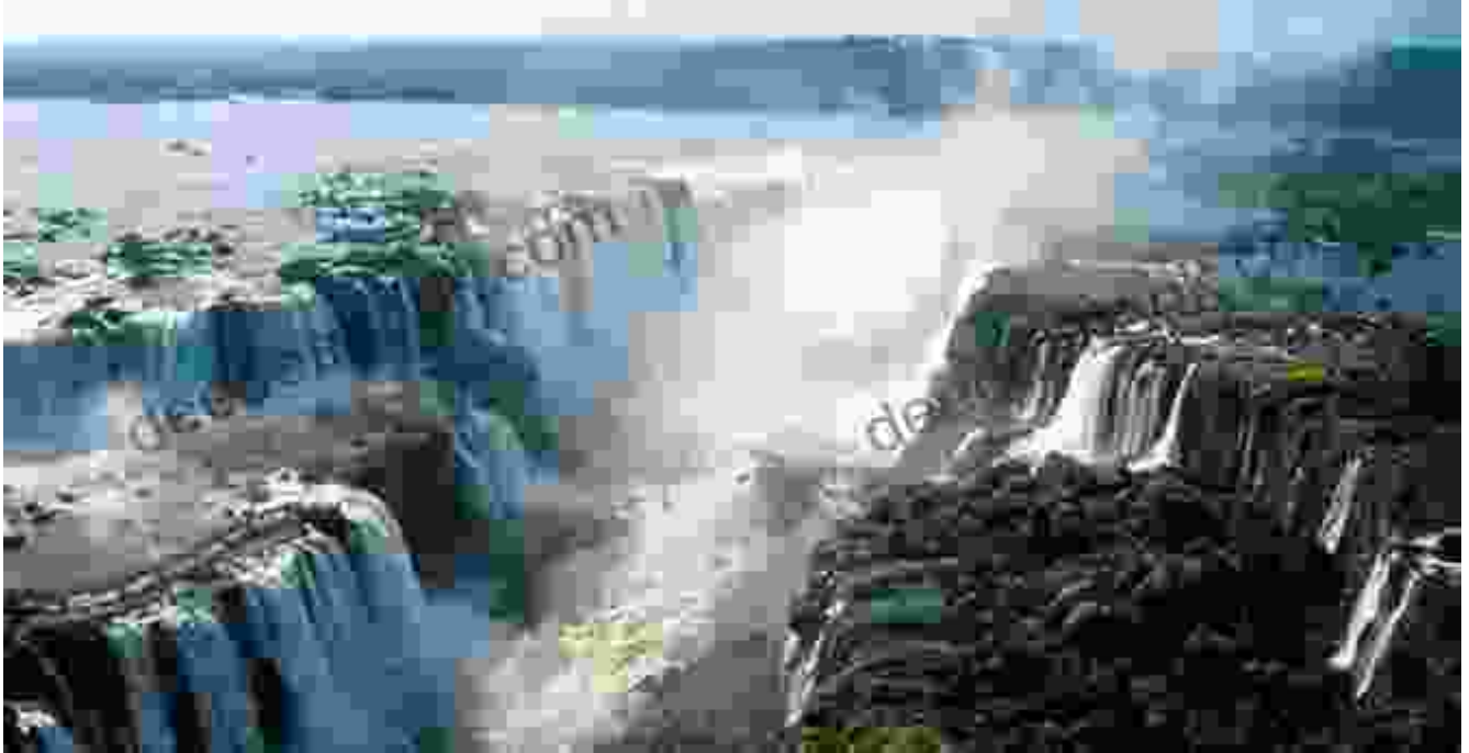
Iguazu Falls, a thunderous natural wonder and UNESCO World Heritage Site