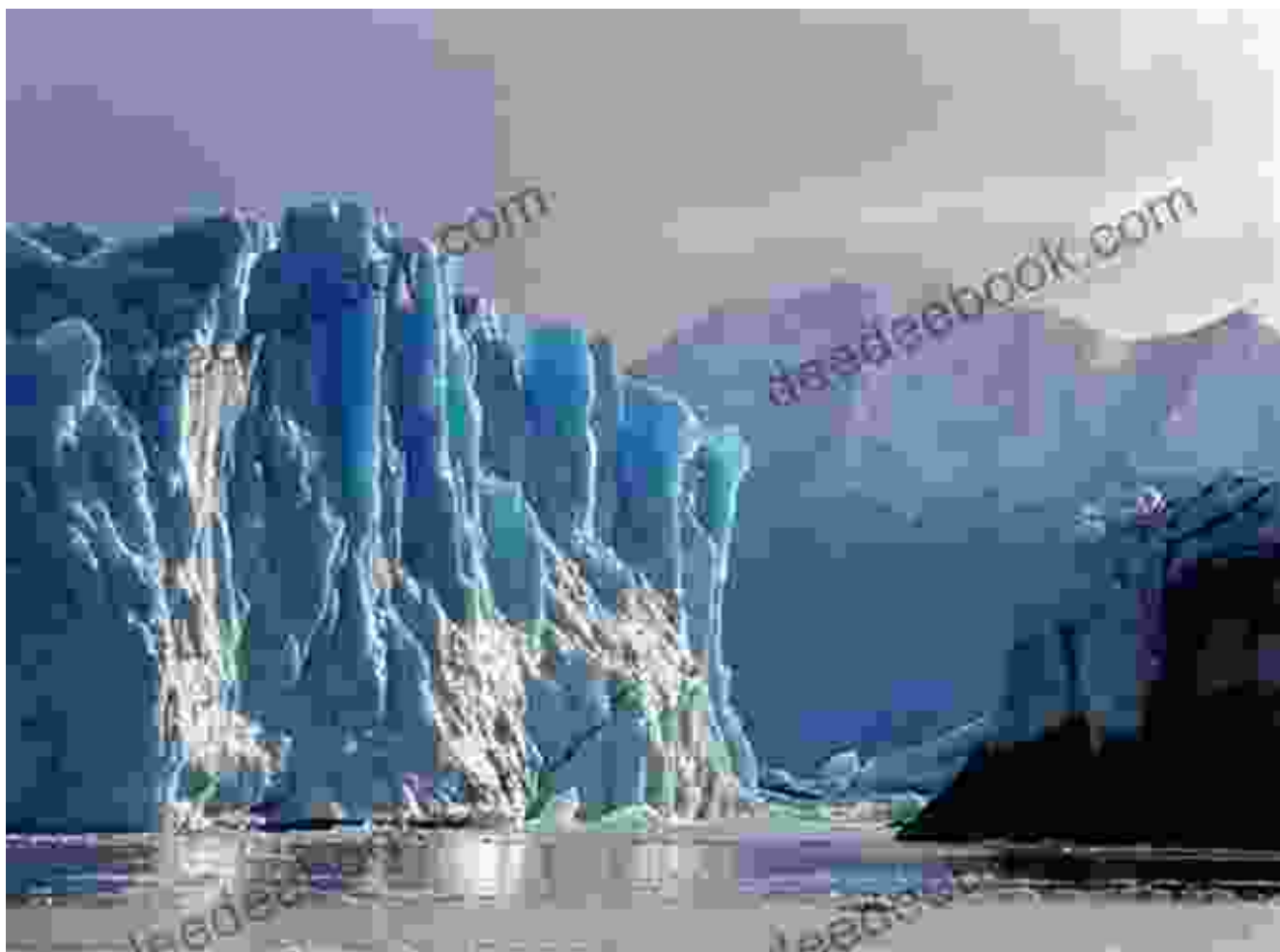
Perito Moreno Glacier, a majestic natural wonder of Patagonia

One of the most iconic natural wonders of Patagonia is the Perito Moreno Glacier. This massive glacier, located within Los Glaciares National Park, is a sight to behold, stretching for over 30 kilometers and reaching a height of 60 meters. The glacier's icy expanse shimmers in shades of blue, and its constant movement creates thunderous sounds that echo through the surrounding mountains.