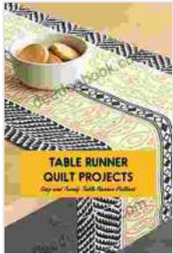
Table Runner Quilt Projects: Easy and Trendy Table Runner Patterns

Table runners are a great way to add a touch of style and personality to your dining table. With so many different patterns and fabrics to choose from, you're sure to find the perfect table runner to match your style and decor. So get creative and have fun sewing your own table runners!