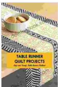
Table Runner Quilt Projects: Easy and Trendy Table Runner Patterns

Table runners are a versatile and stylish way to add a touch of personality to your dining table. They can be used to protect your table from spills and scratches, or simply to add a decorative touch. With so many different patterns and fabrics to choose from, you're sure to find the perfect table runner to match your style and decor.