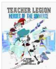
Image of a diverse group of teachers standing in a classroom, smiling and inspiring students. They represent the power and impact of Teacher Legion in empowering educators to ignite young minds and shape the future.