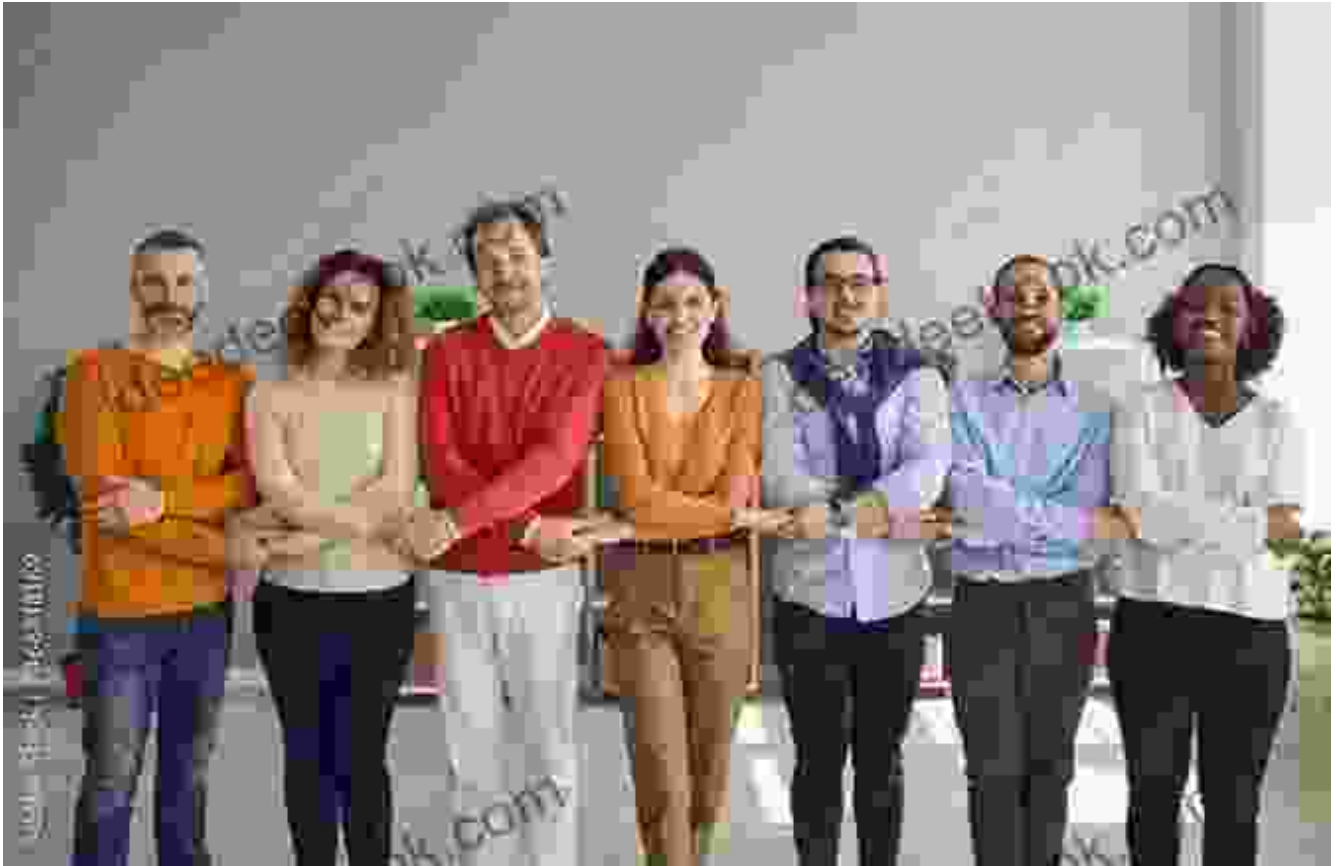
Image description: A diverse group of people stand together, representing the interconnectedness of race and history.

Race is a complex and multifaceted social construct that has profound implications for individuals and societies. While often perceived as a natural and immutable characteristic, race is in fact a product of historical processes and power dynamics. In "Traces of History: Elementary Structures of Race," we delve into the intricate relationship between history and race, exploring how past events have shaped and continue to influence contemporary racial structures and inequalities.