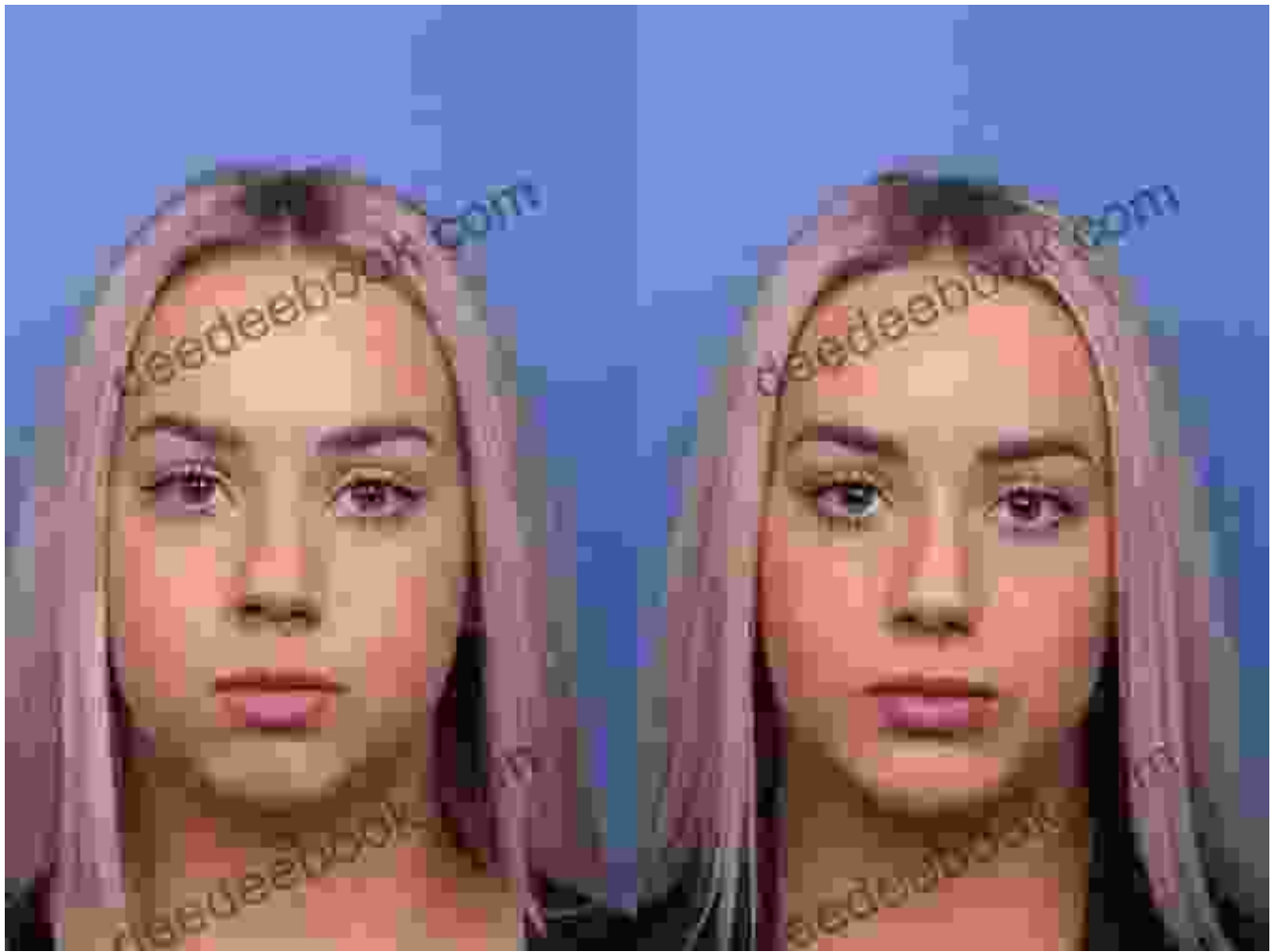
Before and after chin augmentation